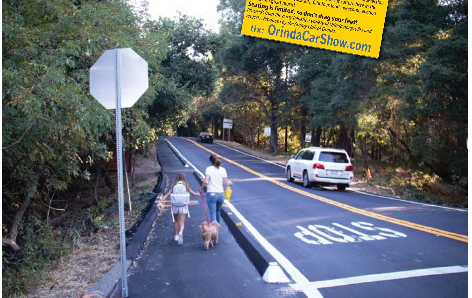
An elementary school student walks along on the new path constructed along Glorietta Boulevard.